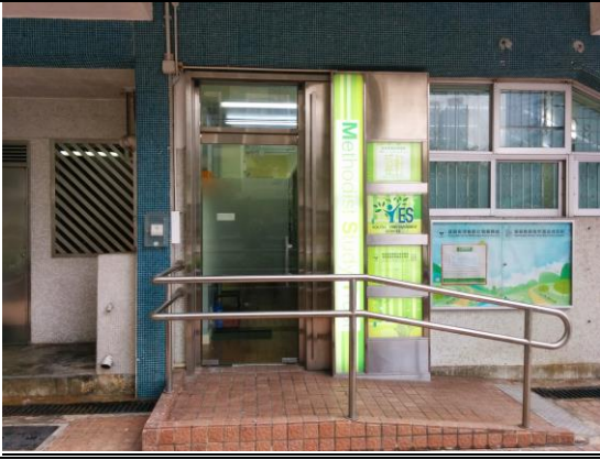
Entrance to YES Centre.